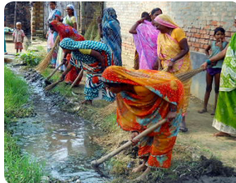
Foreign Affairs, Trade and Development Canada / Affaires étrangères, Commerce et Développement Canada