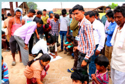
Village Mapping in Chanda, Maharashtra

Save A Family Plan's Community Development Program aims to give impoverished villages the support that they need to improve their quality of life. Our local field staff work with them to identify the poverty-related problems that they face and, using the skills and resources that they have available, plan activities to solve them.