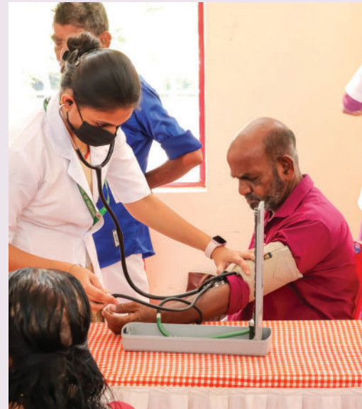
Pictured from upper left, clockwise: a mother and child enjoy fresh, clean water; a family poses outside their new home; a boy learns basic math skills; a man receives a health-care checkup; women learn advanced tailoring and sewing skills; a woman poses outside new sanitary toilet facilities.

In addition to our Family Development Program, which works directly with families, Save A Family Plan's Community Development Programs address conditions related to poverty, on a larger scale. Please read the back of this page to see the work we have planned for 2024-25. There are many projects, large and small, that need funding. We hope that one of them will touch your heart and inspire you to pledge your financial support for the coming year.