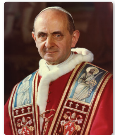
Pope St. Paul VI

During his time in India, Pope St. Paul VI was appalled by the widespread poverty and famine